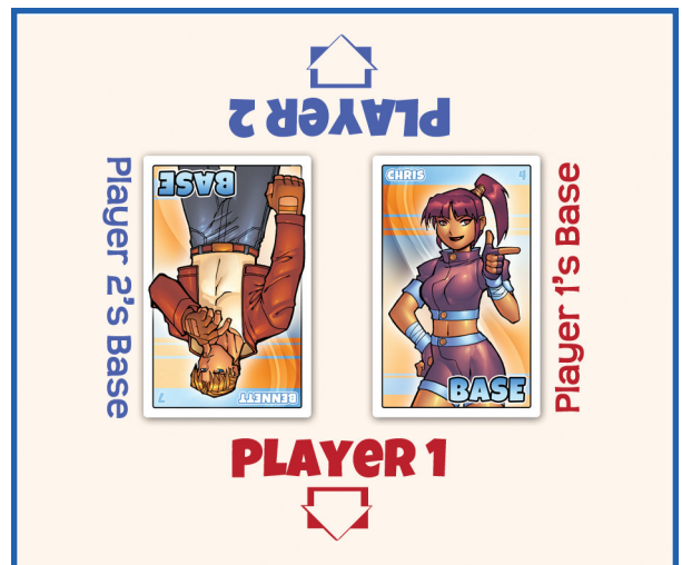
Figure 1: The opening setup.

Put each player's Base card in the middle of the table, side by side, as shown below. Now you're ready to play!