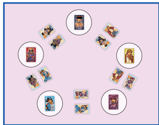
Figure 3: A Five-Player Round Robin Setup.

If the first round is tied, which happens often, then the tied players play another round. This slowly reduce the field of competitors until a single player wins.